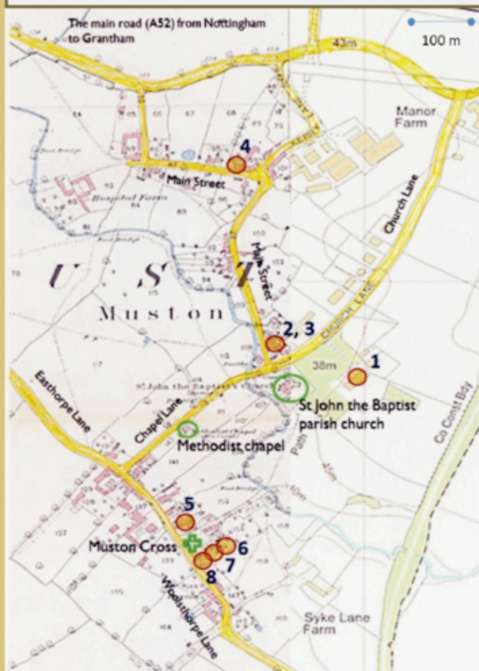
Muston in 1914 - based on the Parish Map of 1884 (Ordnance Survey) and the Census of 1911.

d—died; yrs—years; KiA—killed in action; DoW—died of wounds